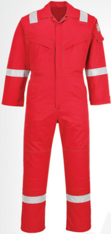
▶ Working Coverall CGM-1201