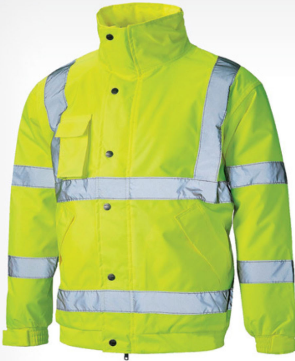
► Working jacket CGM-1405