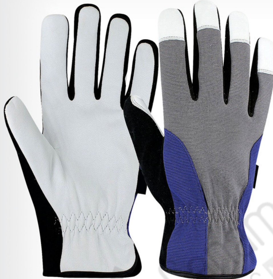
Driver / Assembly Glove CMG-307

Front Made of Goatskin Leather & Back Four-way With Foam, Playboy Lamination.