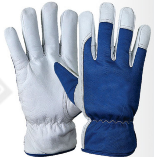
Driver / Assembly Glove CGM-303