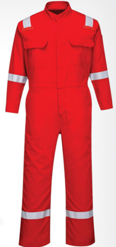
▶ Working Coverall CGM-1203