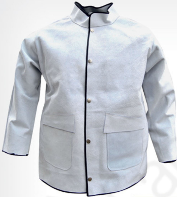
▶ Welding Jacket CGM-1101