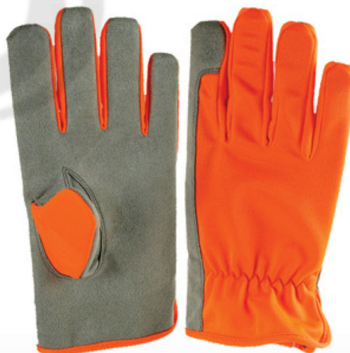
Gardening Glove CMG-405

● Goatskin leather white. Sublimated Fourway Fabric. ● Inside playboy with foam lamination. Elastic on wrist.