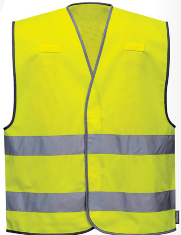
▶ Safety Vest Reflective Strips CGM-1404