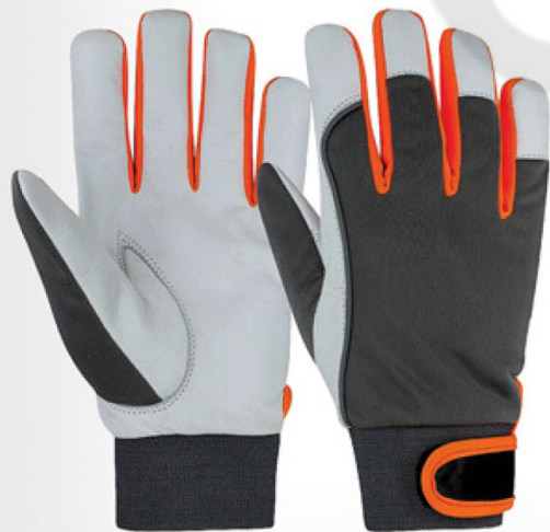
Driver / Assembly Glove CMG-312

● Front Made of Goatskin Leather & Back Trinda Fabric And Polyester Piping