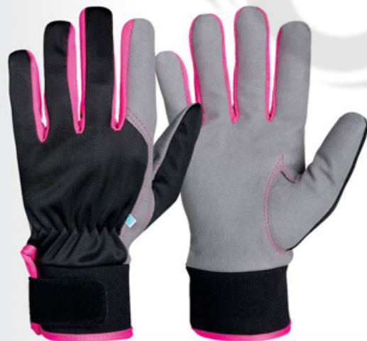
Driver / Assembly Glove CGM-306