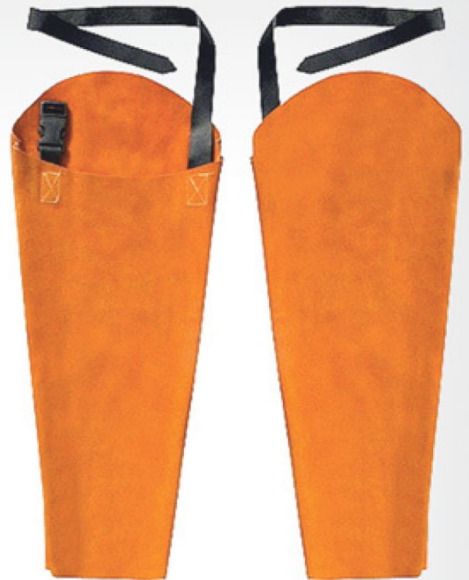
▶ Welding Hand Sleeve CGM-1153