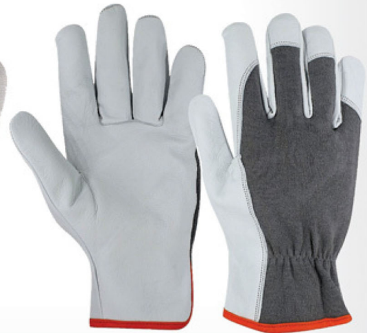
Driver / Assembly Glove CMG-310

● Front Made of Goatskin Leather & Back Trinda Fabric And Polyester Border.