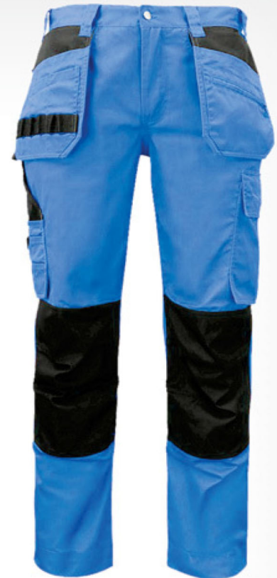
▶ Working Trouser CGM-1303