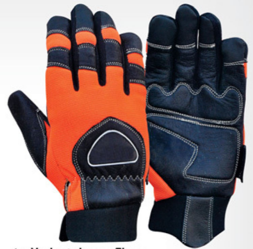
Mechanic Impact Glove CMG-149

Front Side Goat skin leather with rubber padding on palm. Back Side Front Side Goat skin leather TPR LOGO. Split leather Cuff. Reflector Tape. Inside HSP Liner (High strength Polyethylene).