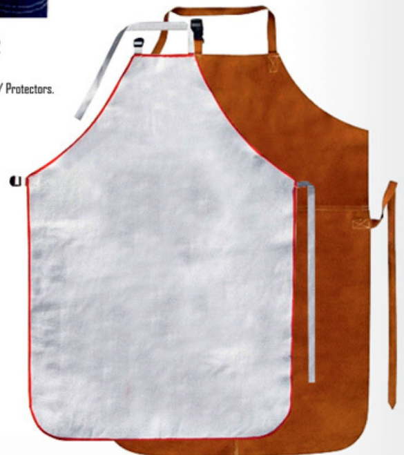
▶ Welding Aprons CGM-1105