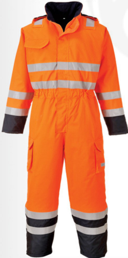
▶ Hi-Vis Reflective Nomex Coverall CGM-1204