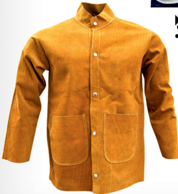
▶ Welding Jacket CGM-1104