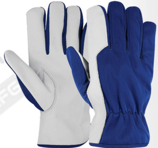
Driver / Assembly Glove CMG-309

● Front Made of Goatskin Leather & Back Cotton Fabric.