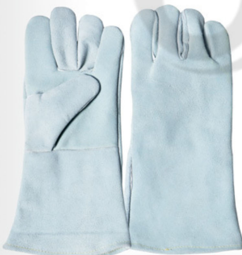
Welding Glove CGM-206

● Made of Split leather (White). Jean + Fleece Lining, 16 inch Size