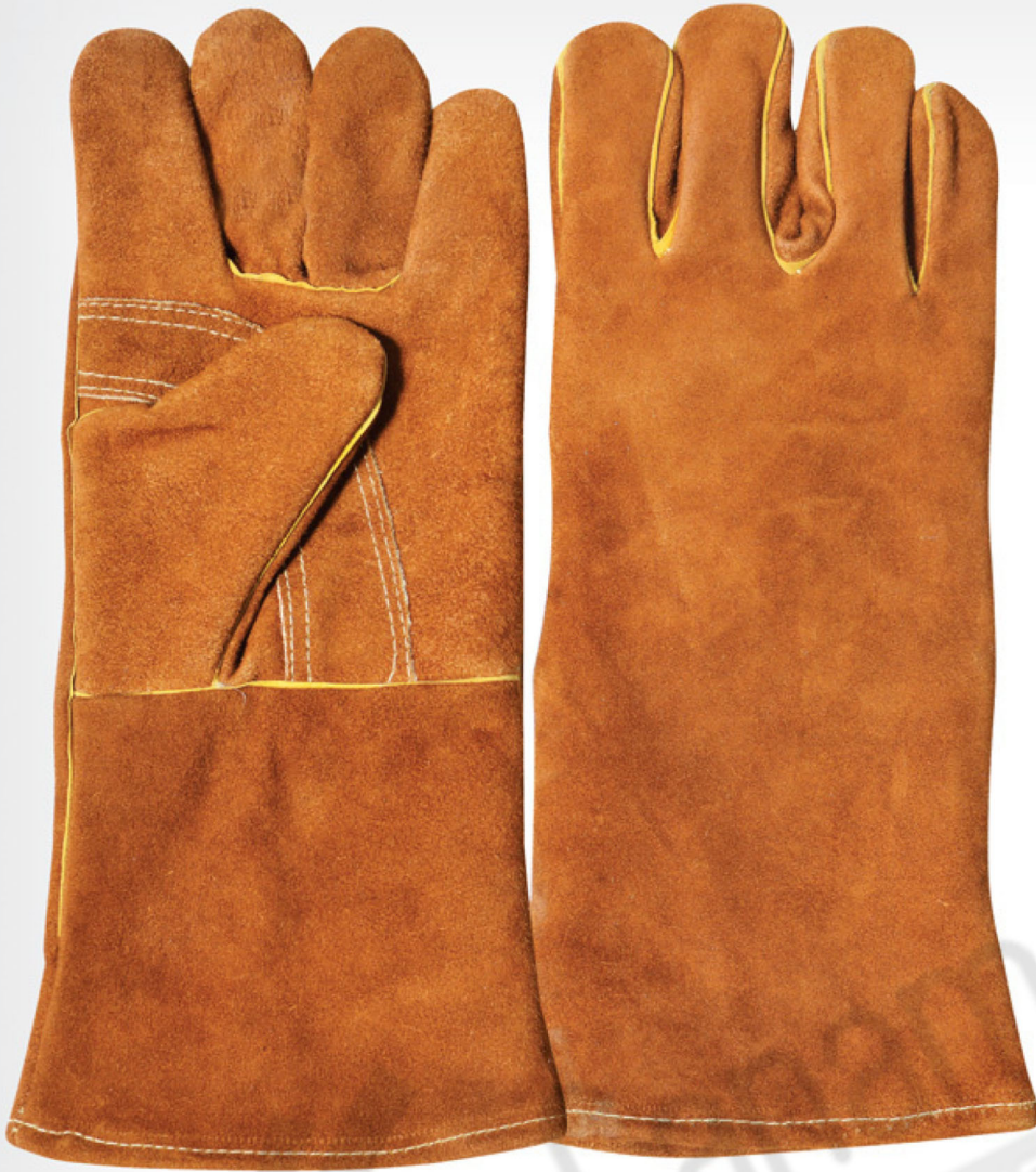
Welding Glove CGM-201

Made of Split leather (Brown). Playboy and foam lamination Jean + Fleece Lining, Kevlar Thread, 14 inch Size