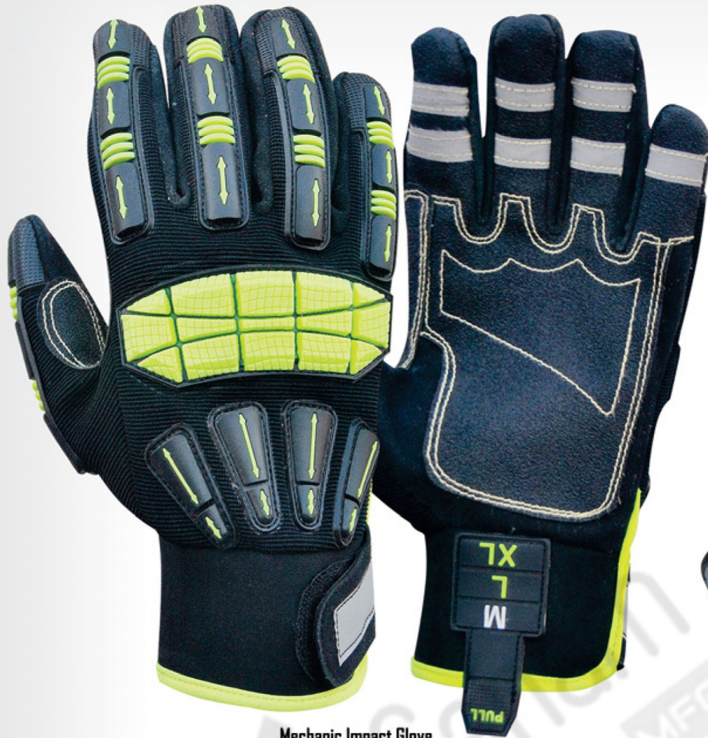
Mechanic Impact Glove CMG-148

Front Side Goat skin leather with rubber padding on palm. Back Side Front Side Goat skin leather TPR LOGO. Split leather Cuff. Reflector Tape. Inside HSP Liner (High strength Polyethylene).