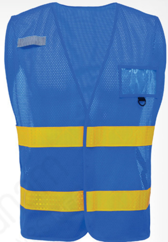
▶ Hi Vis Traffic Safety Vest CGM-1401