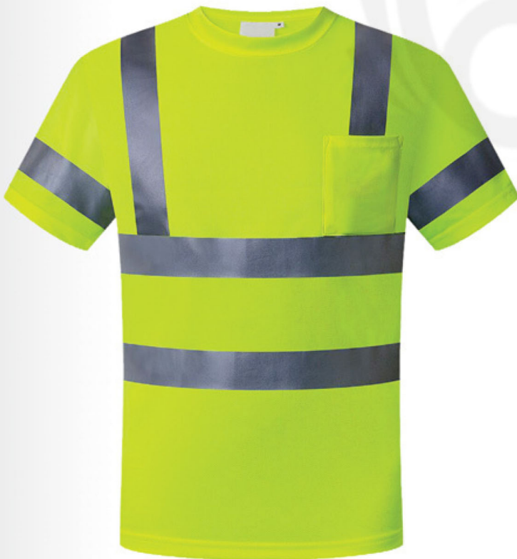
► Safety Breathable Work Polo-Shirt CGM-1407