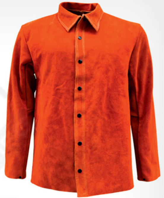
▶ Welding Jacket CGM-1102