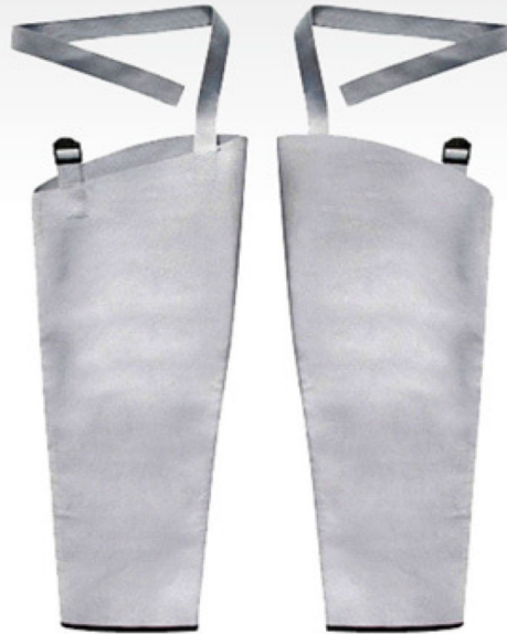
▶ Welding Hand Sleeve CGM-1152