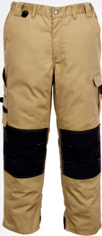
▶ Welding Shoe Cover CGM-1301