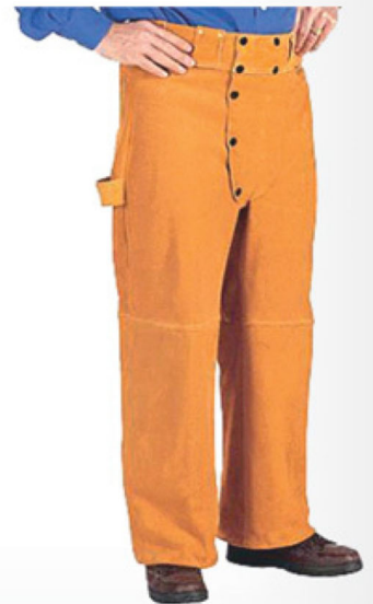
▶ Welding Pant CGM-1159