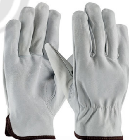
Driver / Assembly Glove CGM-305