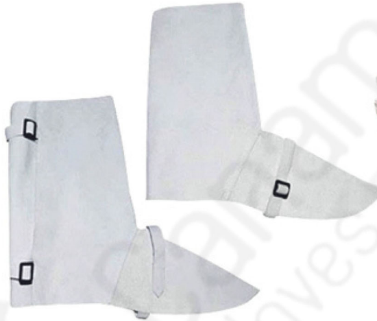
▶ Welding Shoe Cover CGM-1155