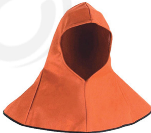
▶ Welder Leather Hood CGM-1158