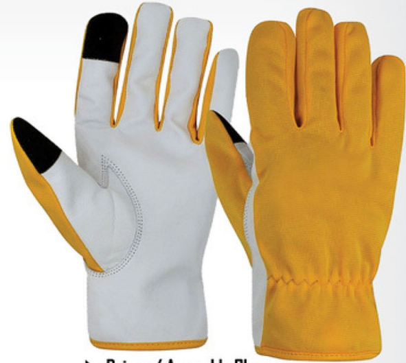
Driver / Assembly Glove CMG-308

Front Made of Goatskin Leather & Back Four-way With Foam, Playboy Lamination.