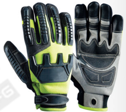
Mechanic Impact Glove CMG-150

Made of Goatskin leather, palm in silicon dotted, reinforcement with foam padding, TPR back on hand protection, hydraulic fraking, inside fully lined, effective protection against impact and abrasion