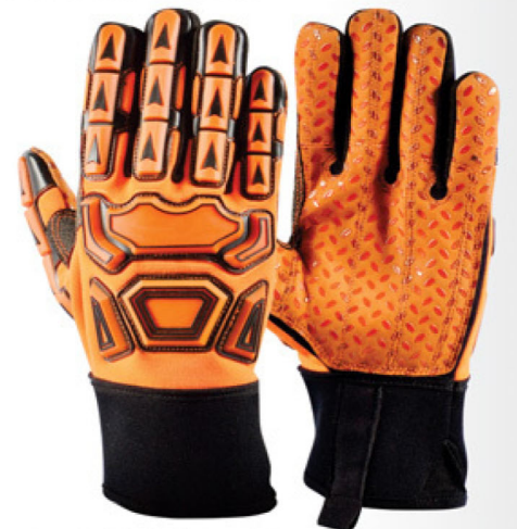
Mechanic Impact Glove CMG-151

Made of Synthetic leather, palm in silicon dotted, reinforcement with foam padding, TPR back on hand protection, hydraulic fraking, inside fully lined, effective protection against impact and abrasion, strong grip, non slip, Hi-Viz