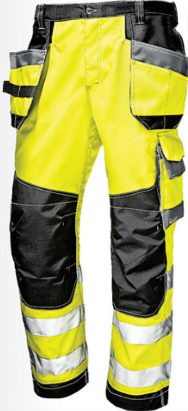
▶ Rush Trouser CGM-1304