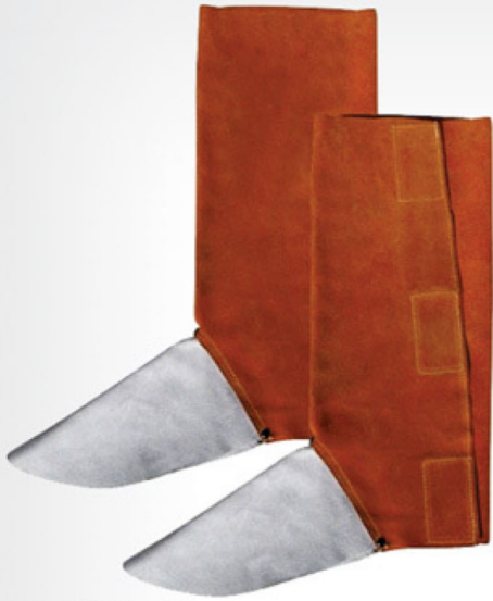
▶ Welding Shoe Cover CGM-1151