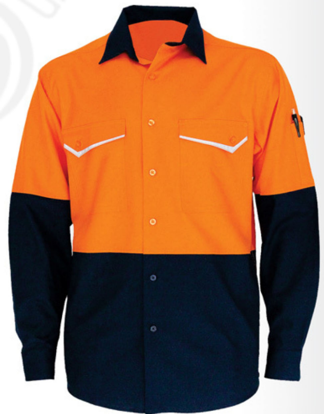
► Work Shirt - Long Sleeve CGM-1408