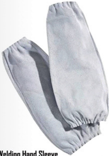
▶ Welding Hand Sleeve CGM-1154