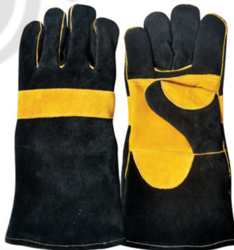
Welding Glove CGM-205

● Made of Split leather (White). Jean + Fleece Lining, Kevlar Thread, 14 inch Size