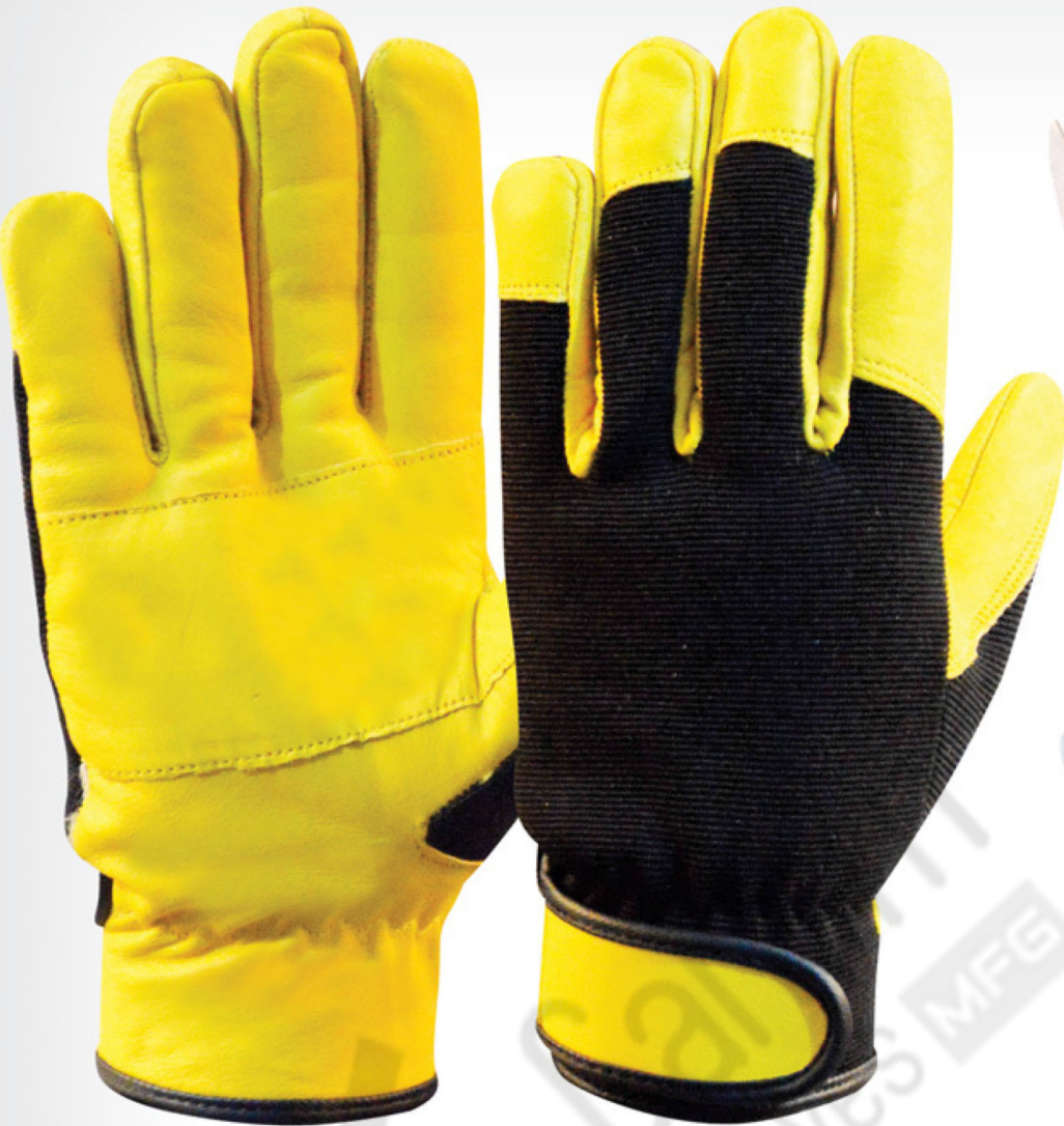
Driver / Assembly Glove CGM-301

Assembly glove. Palm made of Goatskin leather back yellow Sheep interlock. Wing thumb, 3 finger tips on back, and yellow elastic cuff with Velcro closure.