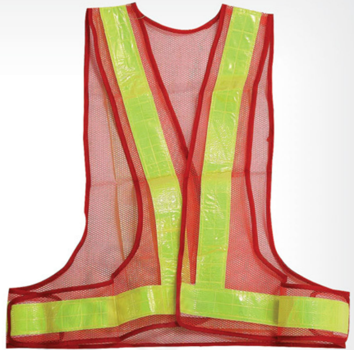
► Waistcoats Safety Vest CGM-1406