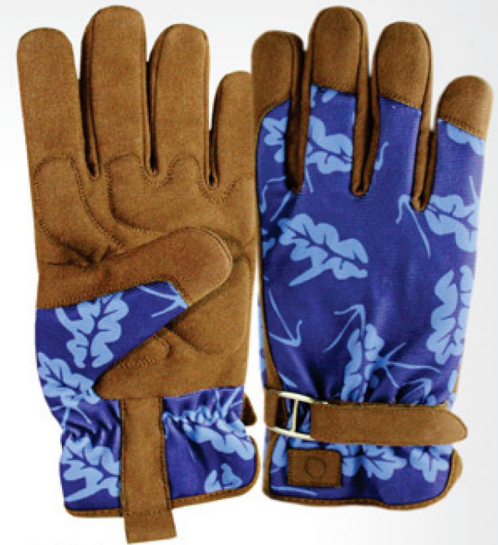
Gardening Glove CMG-402

Synthetic leather Brown. Sublimated Fourway Fabric. Inside playboy with foam lamination. Steel Buckle and strap Closure.