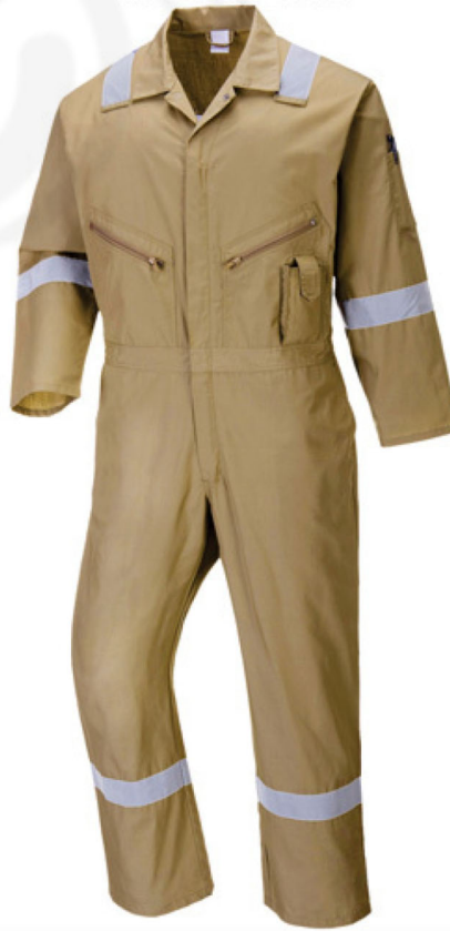
▶ 100% Cotton Coverall CGM-1205