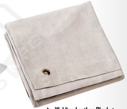
▶ Welding Leather Blanket CGM-1156