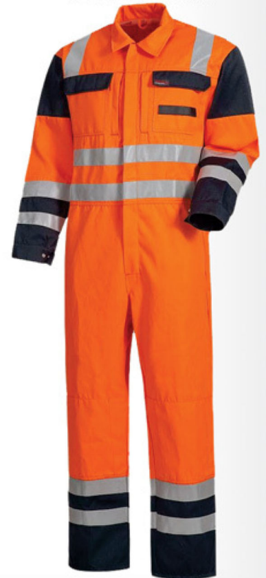
▶ Hi Vis Coverall CGM-1206