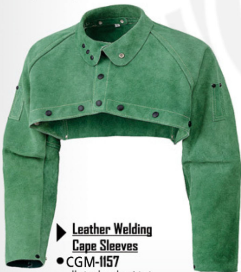
▶ Leather Welding Cape Sleeves CGM-1157