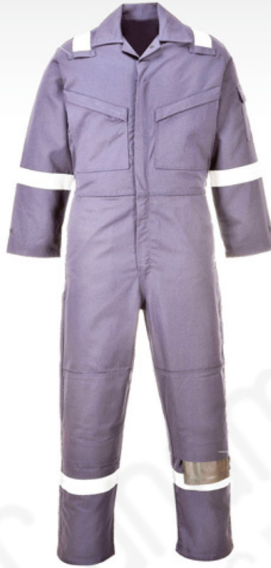
▶ Working Coverall CGM-1202