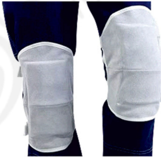
▶ Welding Knee Protector CGM-1103