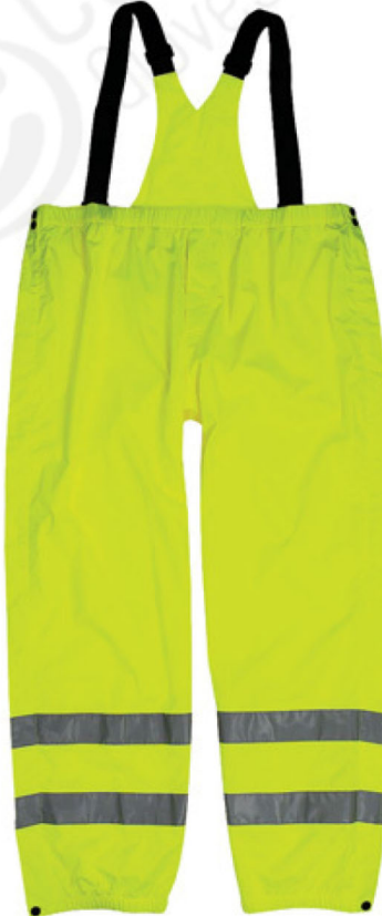
▶ Functional Working Trouser CGM-1305