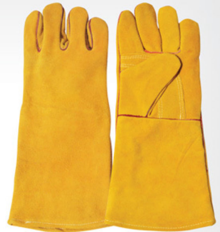
Welding Glove CGM-202

Made of Split leather (Brown). Playboy and foam lamination Jean + Fleece Lining, Kevlar Thread, 14 inch Size