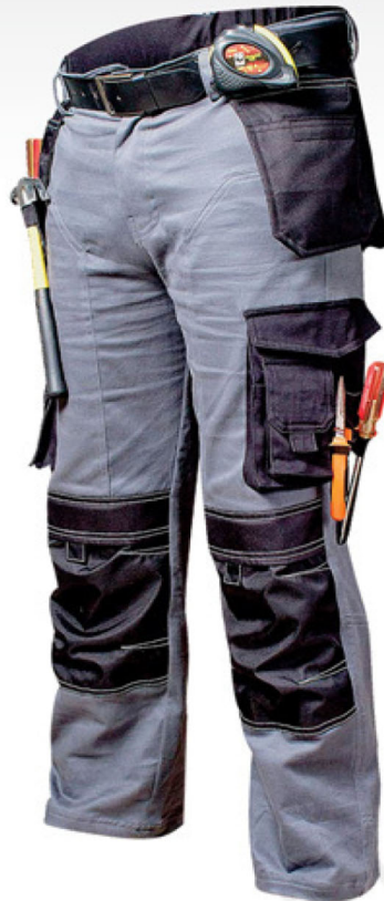
▶ Welding Shoe Cover CGM-1302