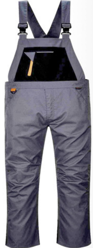
▶ Work Bib & Brace CGM-1306