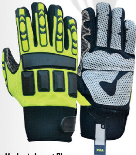
Mechanic Impact Glove CMG-153

Made of Synthetic leather (Grey) & Goatskin Leather, palm in silicon dotted, reinforcement with foam padding, TPR back on hand protection, hydraulic fraking, inside fully lined, effective protection against impact and abrasion, strong grip, non slip, Hi-Viz