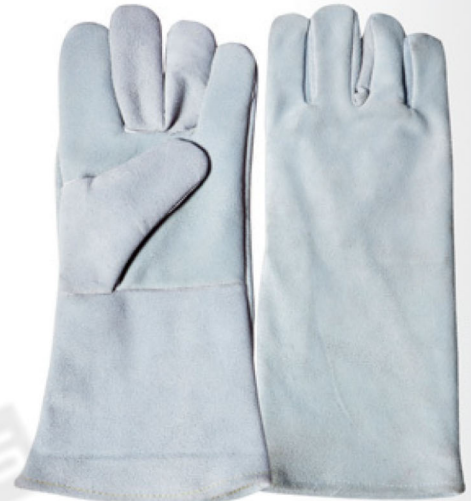
Welding Glove CGM-203

● Made of Split leather (Yellow). Jean + Fleece Lining, Kevlar Thread, 16 inch Size