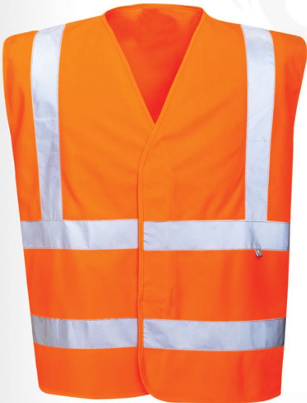
▶ Safety Vest CGM-1403