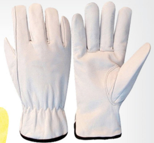
Driver / Assembly Glove CGM-302

Assembly glove. Palm made of Goatskin leather back yellow Sheep interlock. Wing thumb, 3 finger tips on back, and yellow elastic cuff with Velcro closure.