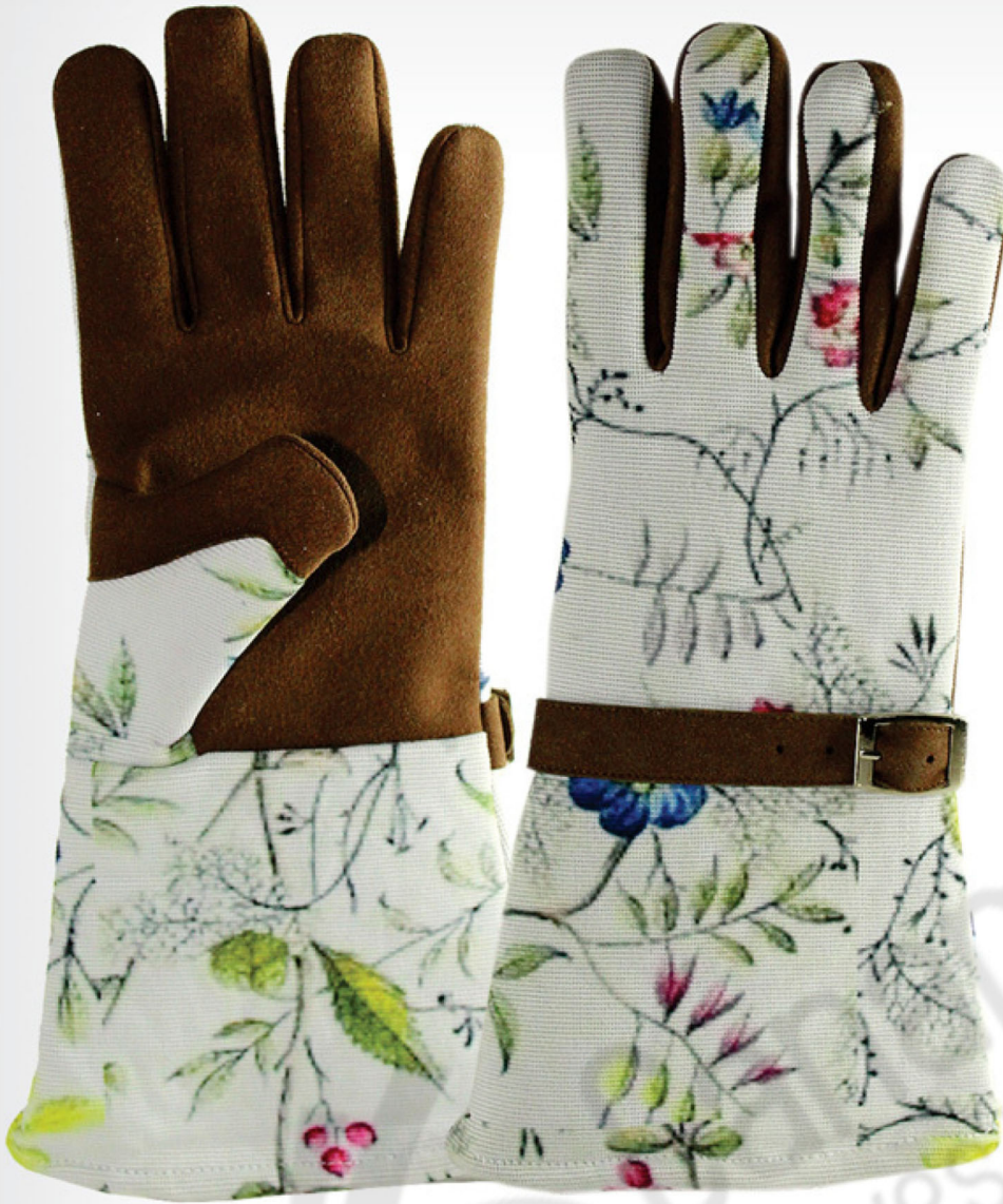
Gardening Glove CMG-401

Synthetic leather Brown. Sublimated Fourway Fabric. Inside playboy with foam lamination. Steel Buckle and strap Closure.