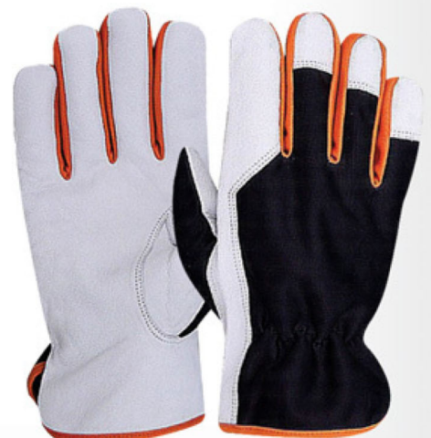
Driver / Assembly Glove CGM-304