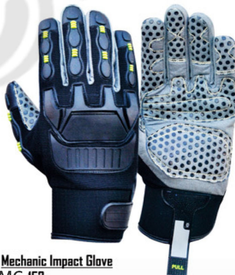
Mechanic Impact Glove CMG-152

Made of Synthetic leather, palm in silicon dotted, reinforcement with foam padding, TPR back on hand protection, hydraulic fraking, inside fully lined, effective protection against impact and abrasion, strong grip, non slip, Hi-Viz