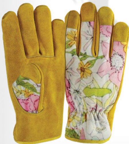
Gardening Glove CMG-406

● Sublimated Soft-Shell Fabric. Inside playboy with foam lamination.