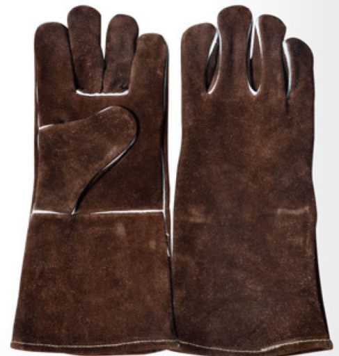
Welding Glove CGM-204

● Made of Split leather (Black/Yellow). Jean + Fleece Lining, Kevlar Thread, 14 inch Size