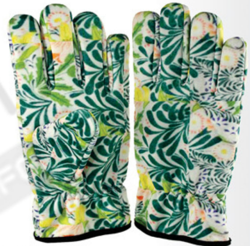
Gardening Glove CMG-403

● Synthetic leather Brown. Sublimated Fourway Fabric. ● Inside playboy with foam lamination. ● Steel Buckle with Hook and Loop Closure.