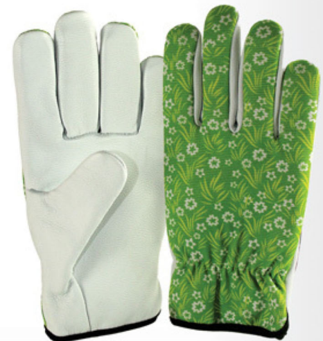
Gardening Glove CMG-404

● Synthetic leather Grey. Back side Trinda Fabric. ● inside playboy with foam lamination. Elastic on Wrist.