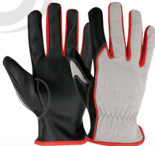
Driver / Assembly Glove CMG-311

● Made of Goatskin Leather, Mesh Fabric Back, Elastic Cuff, Velcro Closure.